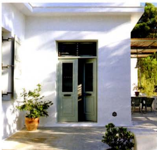
BELOW: the villa on the Greek island of Pegasus has been sensitively restored in the local style but with subtle updating