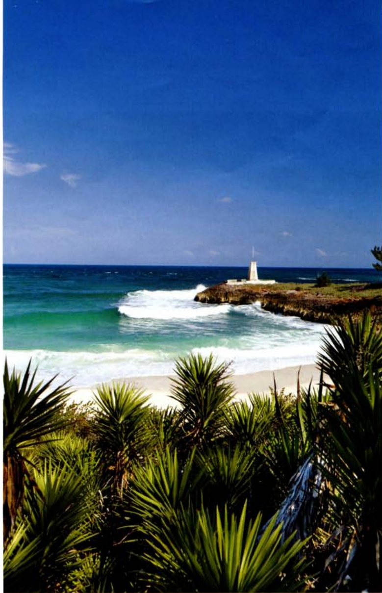
CLOCKWISE FROM LEFT: Little Whale Cay, Bahamas offers privacy alongside great amenities and service; two aspects of Great Mercury Island, New Zealand – still lovely but more temperate; an aerial view of Song Saa, Cambodia, which is being developed into an island paradise