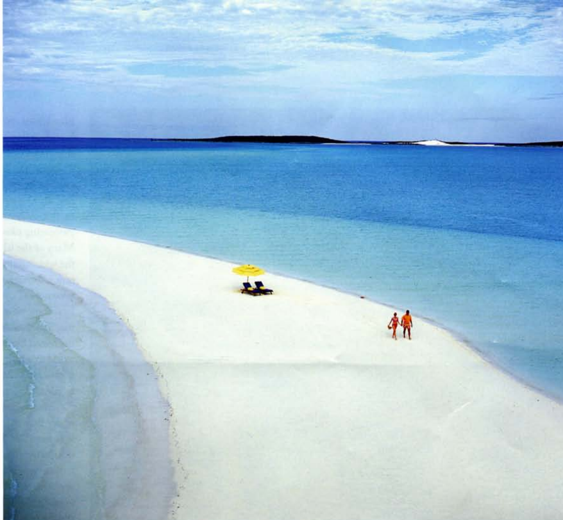
RIGHT: rush hour on the sand bar at Musha Cay, Bahamas.